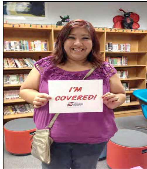
Figure 1: Medicaid Expansion

Starting in January 2014, many states have adopted Medicaid expansion under the ACA to cover low-income, childless young Americans. Students who are at or below 138 percent of the Federal Poverty Level and live in a state that has expanded Medicaid eligibility are able to enroll in Medicaid. The map below depicts where each state stands on Medicaid Expansion as of May 2015, but states can decide to expand Medicaid at any time, and many states continue to debate expansion.